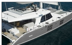
Sunreef to debut two new models at Cannes