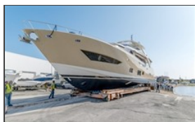
Couach launches new 26M model