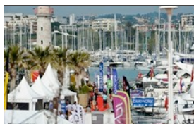
Fewer exhibitors but more visitors at Antibes yacht show