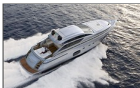
New Pershing 62' at Cannes and Genoa boat shows