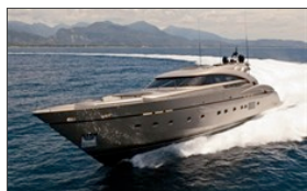
First AB116 coming to Asia