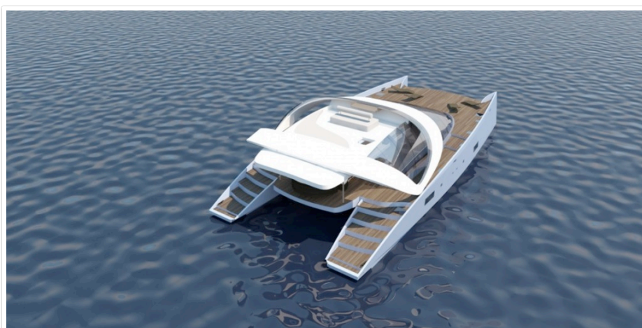
280 square meters of living space

Cannes Boat Show from 10th to 15th September 2013 .