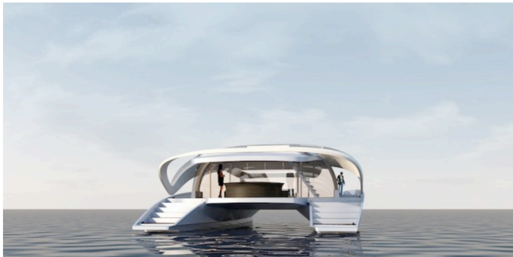
Oxygen Yachts AIR77 Yacht

The first luxury yacht AIR 77 has been built as a 4 main double cabin and 2 double crew cabin version. Interior fittings and decoration are exclusively custom built, according to the wishes of the client.