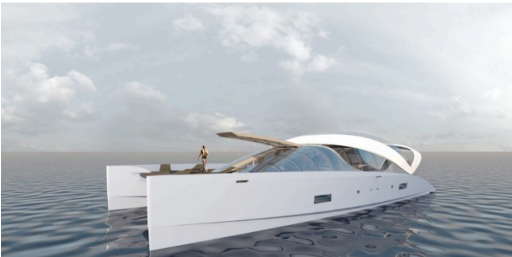
Oxygene Yachts - power catamaran AIR 77

Canopy: anti-UV treated moulded Plexiglas