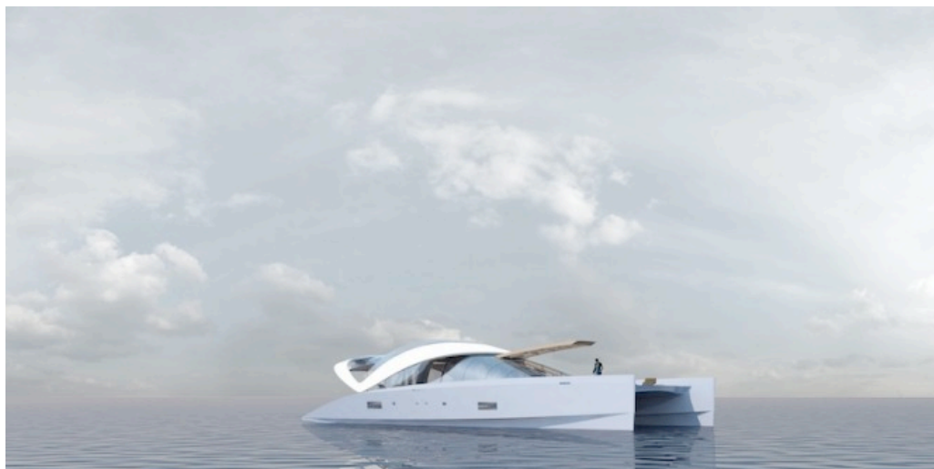
Oxygen Yachts - luxury power catamaran yacht AIR 77

The AIR 77 is set to be launched to the press and public at the Cannes Boat Show from 10th to 15th September 2013 .