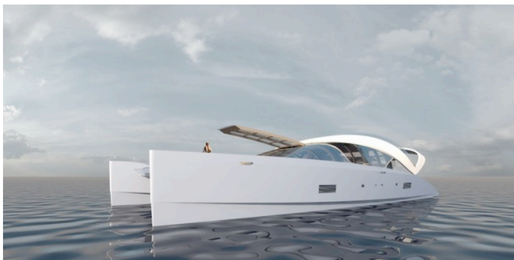
Oxygen Yachts - AIR 77 Yacht

There is nothing tawdry or ostentatious about the luxury catamaran yacht AIR 77. The designer has chosen discretion as his leitmotif, in respect for the natural aesthetics of the sea. Harmony with its environment is demonstrated by the lines of the hull: ultra simple but also extremely efficient on rough seas, and by the boat's low position on the water and its harmonious glass/carbon superstructure.