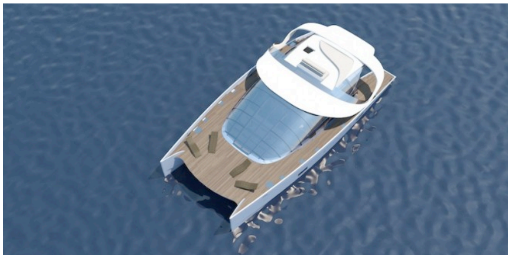
Oxygen Yachts - AIR 77 Catamaran

The cockpits of the new AIR 77 yacht are located under the deckhouse and on the flybridge converted into a sun deck lounge.