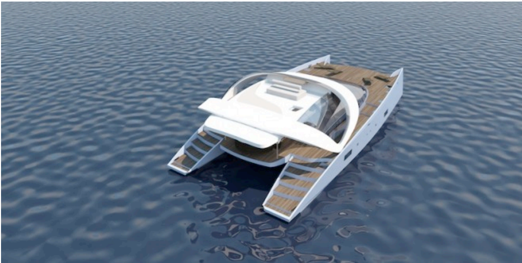
Oxygen Yachts - luxury catamaran AIR 77